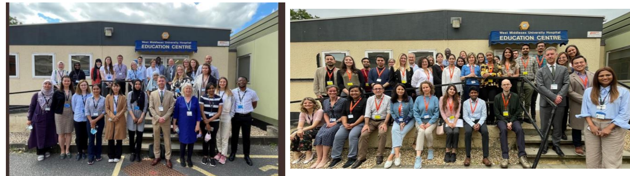
CATP then and now – Left inaugural programme June 2022 and Right current Programme May 2023